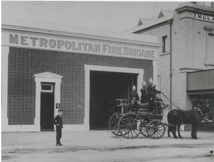
First Fire Station, Norwood, Adelaide